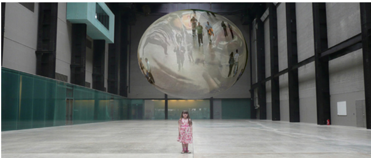
Public Domain, 2008, Stanza. All images and video material are the copyright of the artist and cannot be used or altered in any way without the express consent of the artist.